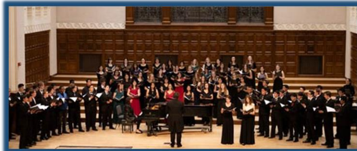
2018 SATB Honor Choir