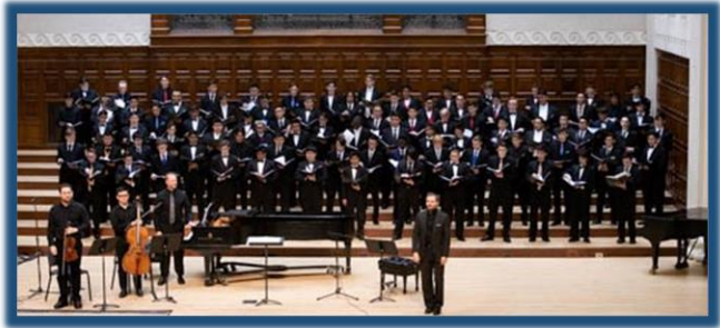
2018 TTBB Honor Choir