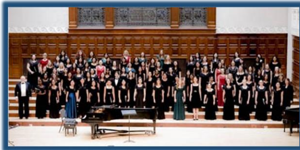
2018 SSAA Honor Choir