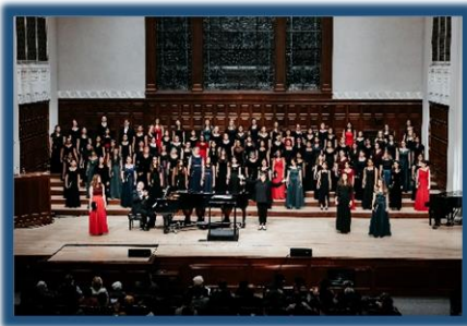
2019 SSAA Honor Choir