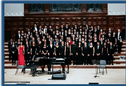
2019 SATB Honor Choir