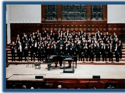
2019 TTBB Honor Choir