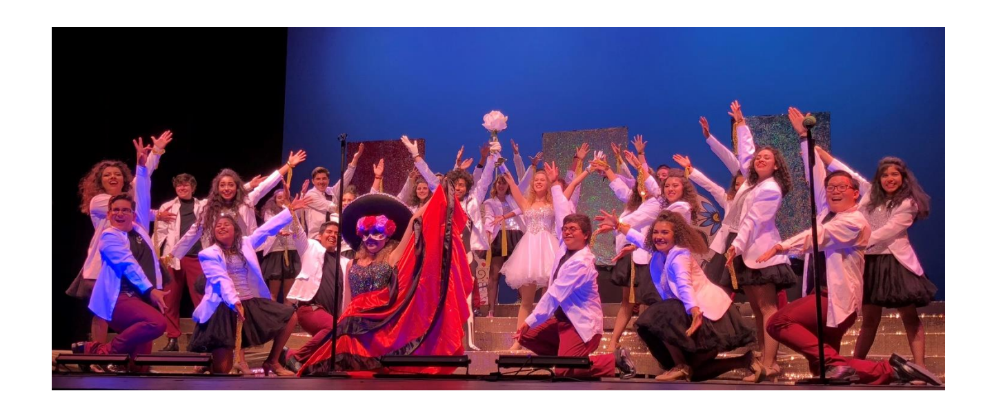
A big SCVA thank you to all participating high schools and their fabulous show choirs.

CONGRATULATIONS to following first place winners: in the Jr. High/Middle School Division - Lexington Middle School "Velocity"; in the Novice Mixed Division, Katella "Queen Bees"; in the Novice Women Division – Riverside Poly "Show Choir"; in the Intermediate Mixed Division – Martin Luther King "Show Choir"; in the Intermediate Women's Division - Brea Olinda "Tiffany's"; in the Advanced Women Division – Brea Olinda "Spellbound" and in the Advanced Mixed Division – Brea Olinda "Masquerade. Musicianship Plaques were awarded to Lexington Middle School, Riverside Poly and Brea Olinda (2 Division Plaques). Showmanship Plaques were awarded to Lexington Middle School, Riverside Poly and Brea Olinda (2 Division Plaques).