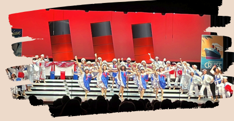
John F. Kennedy HS Ladies First Advanced Treble Division Winners