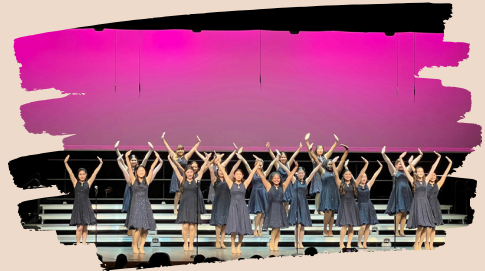
Walnut HS Treble Choir Novice Treble Division Winners