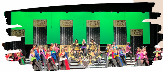
John F. Kennedy HS Executive Order Advanced Mixed Division Winners