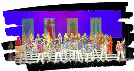
John F. Kennedy HS Secret Service Tenor/Bass Division Winners