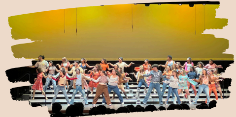
Chula Vista HS Main Attraction Intermediate Mixed Division Winners