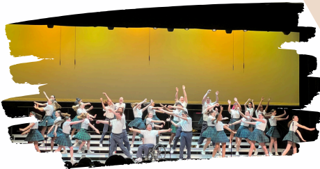
Riverside Poly HS Sound Check Novice Mixed Division Winners